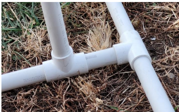
feet to the hoop