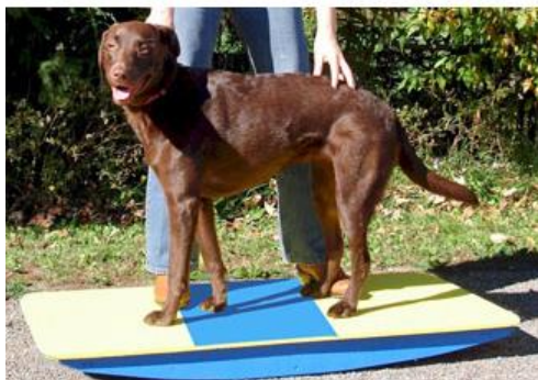
Rocker type fulcrum

Acceptable design options are shown in the photos below.