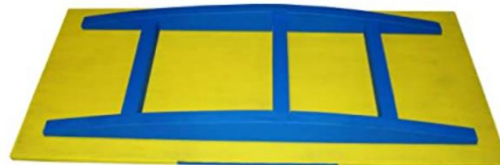
Bottom of rocker board