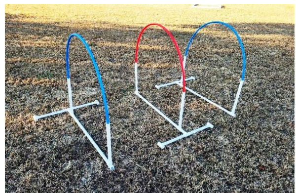
Hooper's hoops example